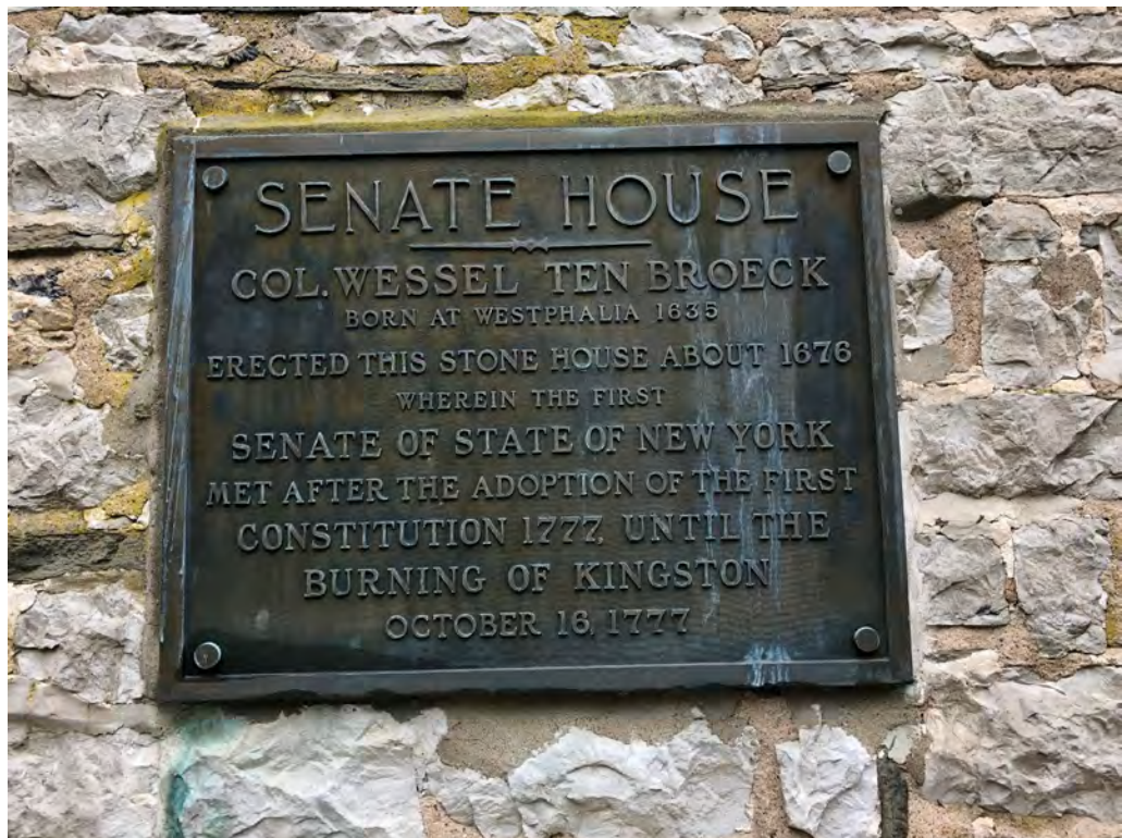
New York State Senate House