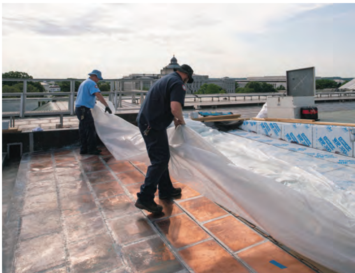
Image: Jason Stone, Brian Jerdon and Kevin Golden install flat seam copper roof panels

The shiny copper turns into warm brown pretty quickly in the rain. However, it can take 20 to 25 years for the natural weathering process to turn the warm brown tone into the distinctive green patina. The thought of rain midproject keeps Glotfelty up at night, “You’re always worried about rain — once the old copper has been removed, the roof has to be covered with the waterproofing membrane and plastic and weighed down.”