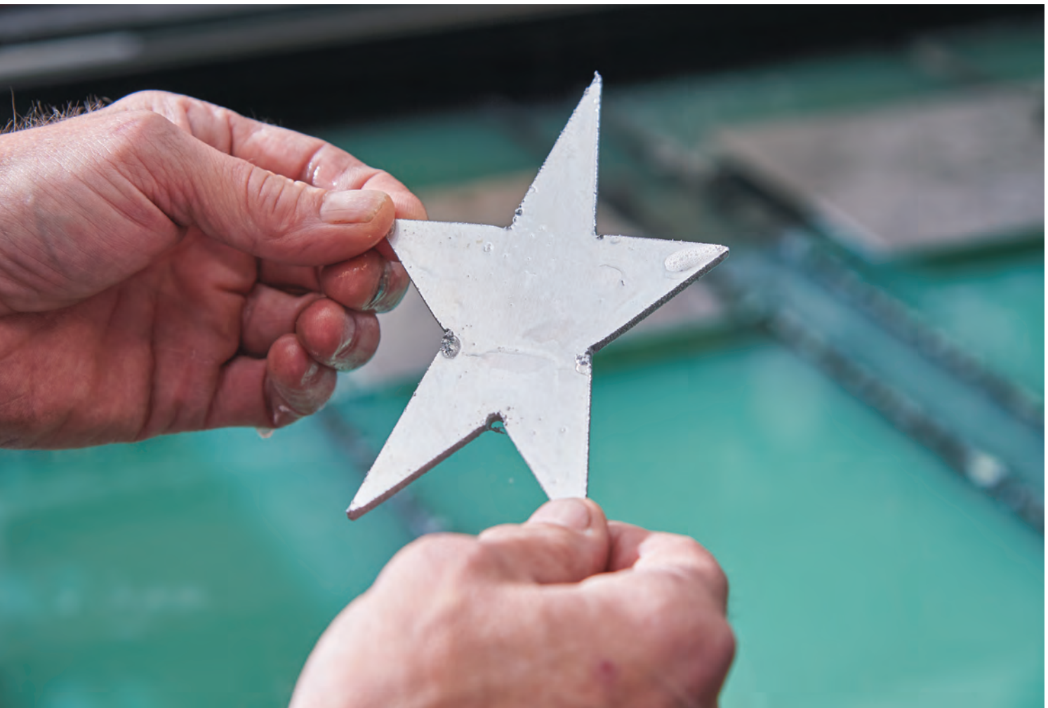
The five-pointed star was cut within seconds

As the plasma torch began cutting out the star, brilliant bursts of sparks and light seared through the aluminum as the torch followed precise lines and angles defined by the software. It finished within seconds. Moments later, Calloway held up the result — a damp but distinct five-pointed star that needed minimal finishing.