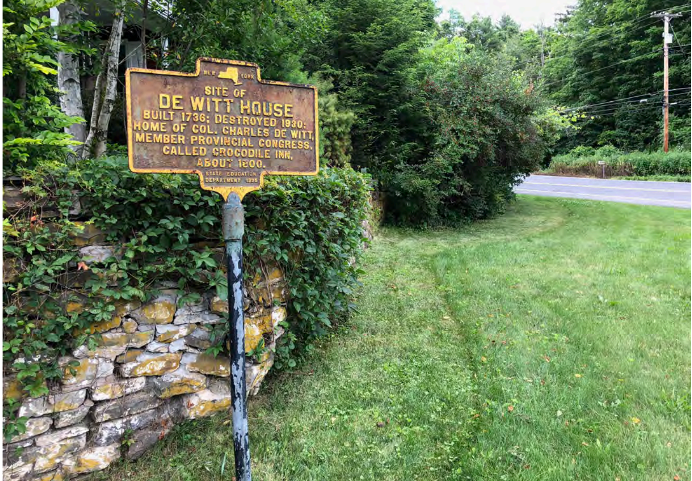
Site of the De Witt house